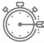
Outcomes not hours