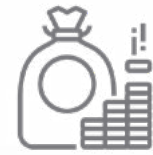
Value for money